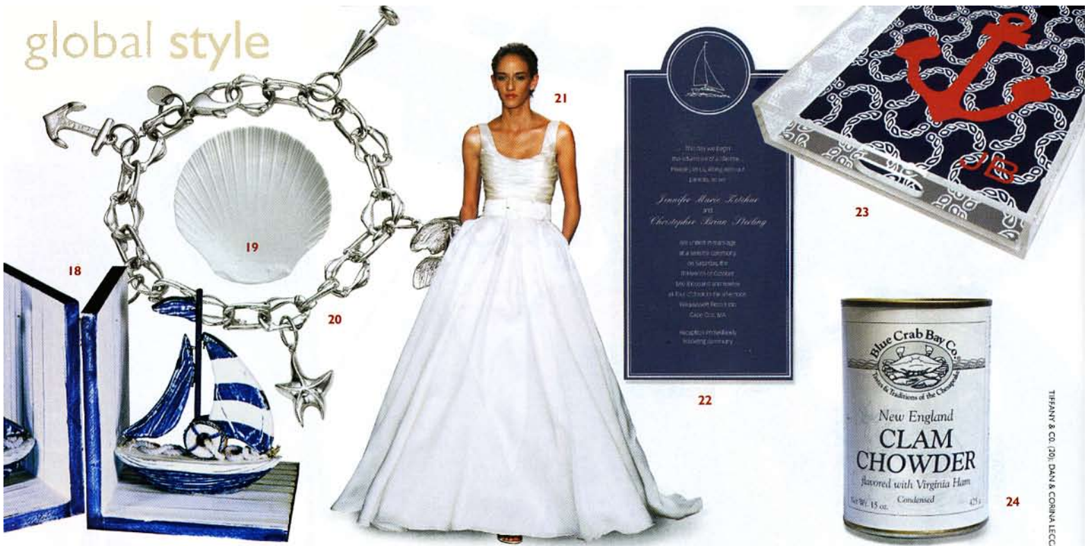
18 AT BOTH ENDS Lamps Plus sailboat bookends, $49.91 19 SHE SELLS SEASHELLS Williams-Sonoma Apilco shell plates, set of two for $64 20 BRACE YOURSELF Tiffany & Co. Seashore charm bracelet, $550 21 COASTAL QUEEN Vineyard Collection Madison ball gown, $2,800 22 PAPER TRAIL Invitation Consultants A Classic Affair invitation, from $160.20 for 25 23 LEARN THE ROPES iomoi ropes-pattern tray, from $100 24 CHOW DOWN Blue Crab Bay Co. New England clam chowder, $5.99